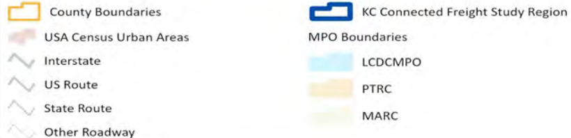
KC Connected Freight Study Region Map