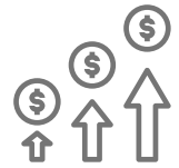
Social and economic status