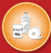
Food and Supplies